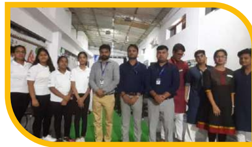
DPS Gomti Nagar, Lucknow