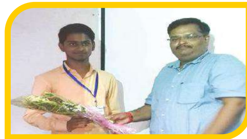
LEADER OF OPPOSITION