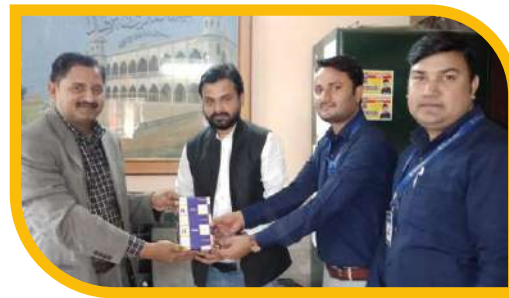
Sunni Inter College, Lucknow