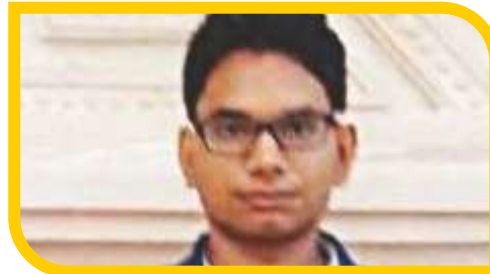
LEADER OF OPPOSITION