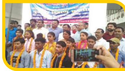
Board Toppers Meet (Rural)