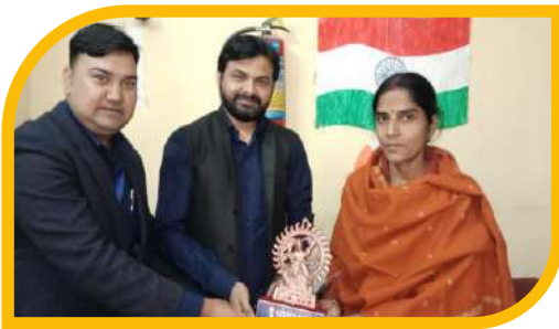
Bright Sun Public Inter College, Lucknow