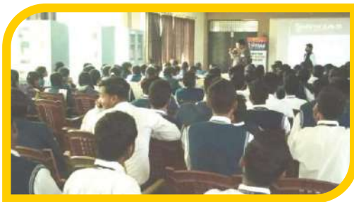
ST.XAVIER'S SCHOOL, BALRAMPUR