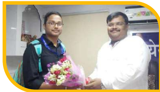
LEADER OF OPPOSITION