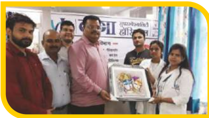
Blood Donation Camp-2019