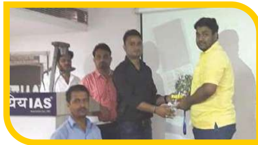
LEADER OF OPPOSITION