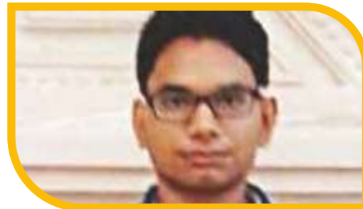
LEADER OF OPPOSITION