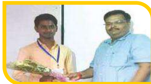
LEADER OF OPPOSITION