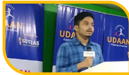
LEADER OF OPPOSITION