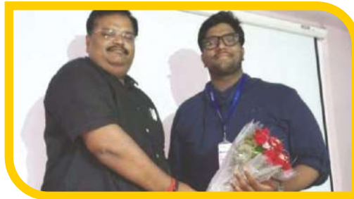
LEADER OF OPPOSITION