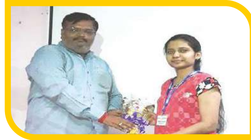
LEADER OF OPPOSITION