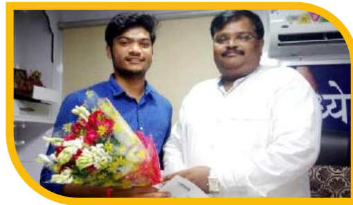
LEADER OF OPPOSITION