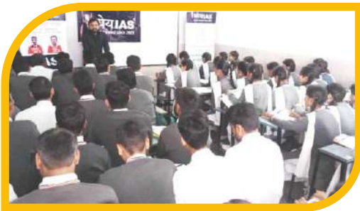
New World Public Inter College, Lucknow